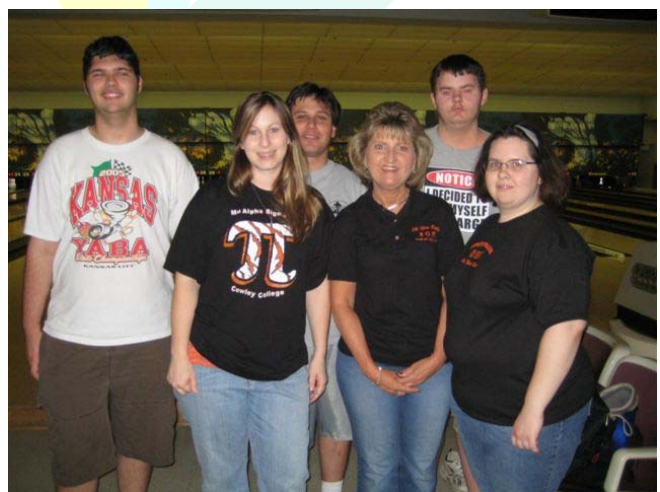
Cowley College Bowling Team

On June 28th, the chapter also participated in the Big Brothers/Big Sisters Bowl for Kids event in Wichita. The chapter's team raised $661.00 for this cause, taking a generous part in the final amount of $13,000 raised that evening.